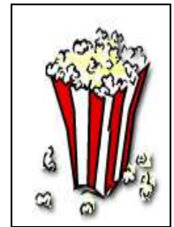
And More Food